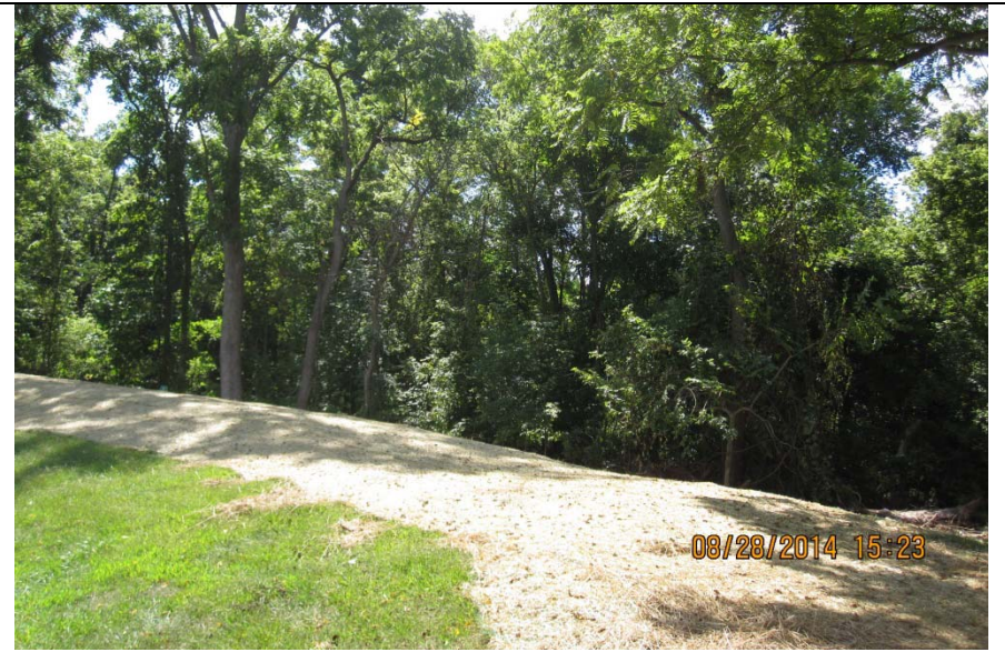
Photo #2: North end of dam with small emergency overflow swale installed, that will only be used if debris plugs the culvert.