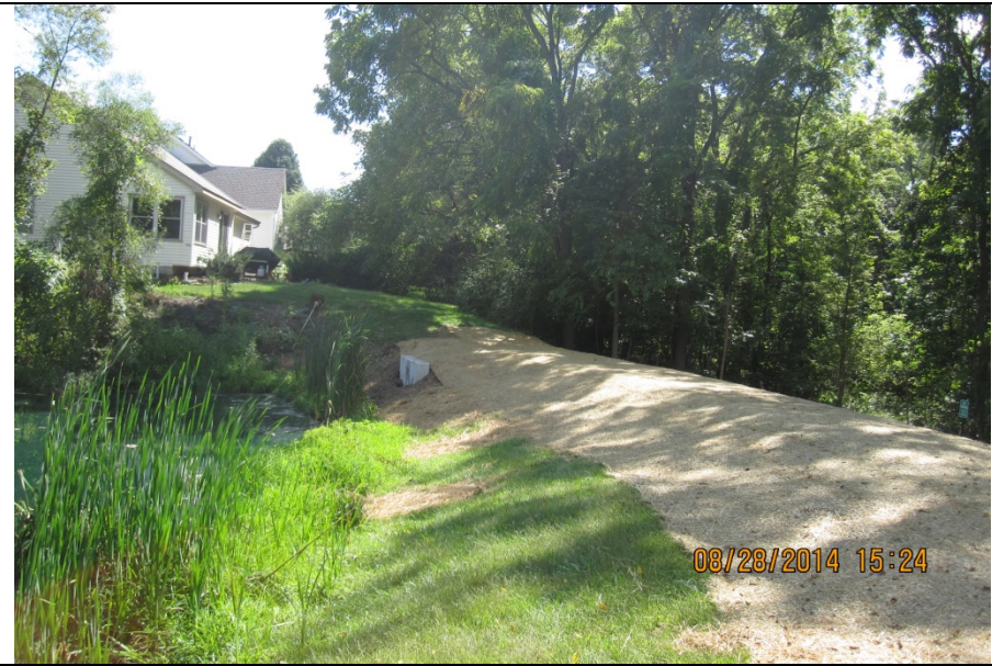
Photo #4: Finished grading the dam. Placed straw matting across soil and seeded the area.